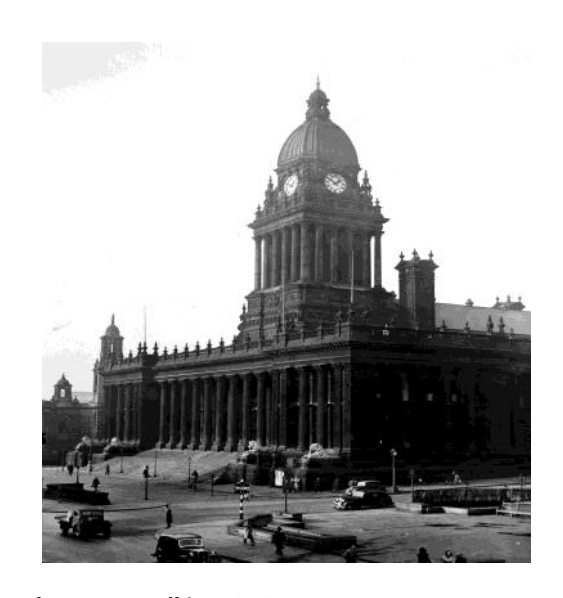
The Town Hall in 1949.

These formidable beasts were added to the Town Hall in 1867, eight years after its opening in 1858. Guarding the entrance to the Town Hall, these symbols of Victorian civic pride are said to leap off their pedestals and explore the City when the Town Hall clock strikes midnight!